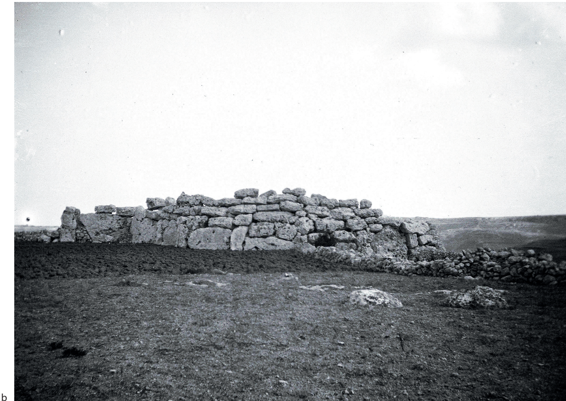
Figure 0.3 (above and opposite). Some views of previous excavations on Gozo and Malta. a) Santa Verna, looking east (Ashby(o).XXXVII.91); b & c) Ġgantija, looking southeast (TA[PHP]-XXVII.083, TA[PHP]-XXVIII.011); d) stone circle, Xagħra (TA[PHP]-XXVII.100).