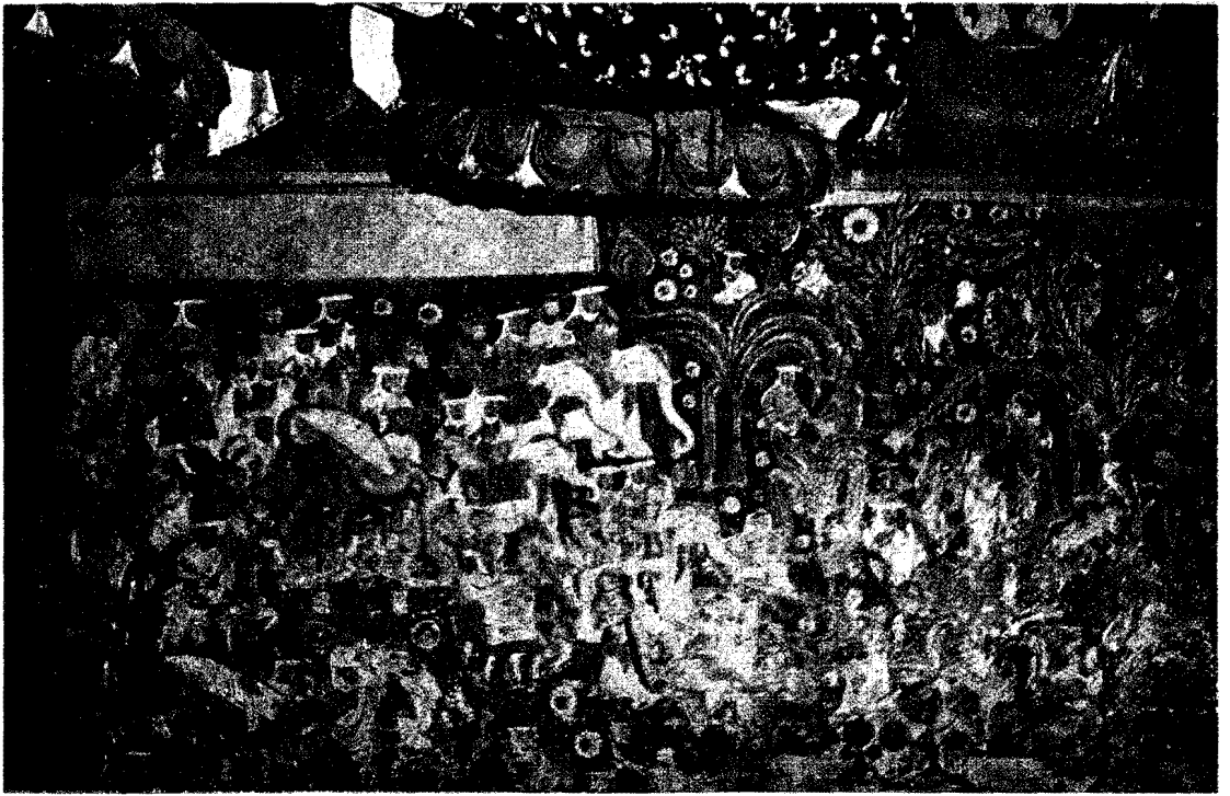
Plate XXI. Tabo, Du-wang : scene depicting royal procession and the birth of Buddha in Lumbini grove