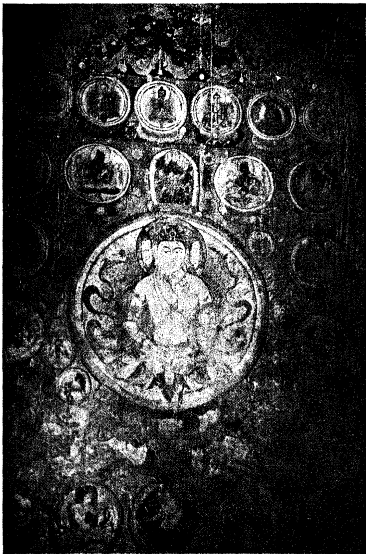
Plate XX. Tabo, Du-wang : scene from the story of Nor-Sang depicting tortures in the hell