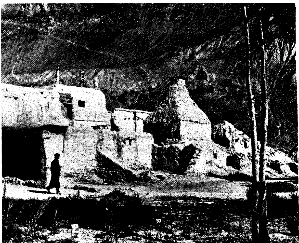
Plate XVII. Tabo monastery: close up of the gamphas

pillars, a few more round pillars have been added in later times to support the falling roof. At the end of the hall is the sanctum with a circumambulatory path. It contains an image of Buddha kept on a lion-throne. A four-faced image of Vairochana is kept on a high seat in front of a wooden platform erected against the last set of pillars. The hall measures 63' x 34' (19·2 × 10·36 m.) approximately.