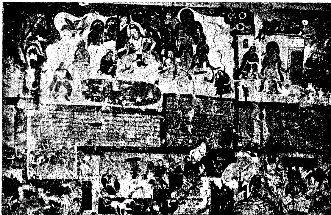
Plate XIX. Tabo, Du-wang : unidentified scene from the story of Nor-Sang with label inscriptions