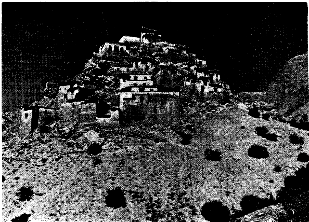
Plate XV. Ki monastery: general view

Rāhula-gupta he went to various monasteries and travelled to Tibet through Nepal. He stayed for three years in Gu-ge as the Chief Religious Guide and thereafter went to central Tibet. After visiting Lhasa and Yer-pa he finally settled in Nye-thang. He died in 1054 and Chō-ten was erected over his relics. He was responsible for influencing the religious thought of Tibet to a very great extent.