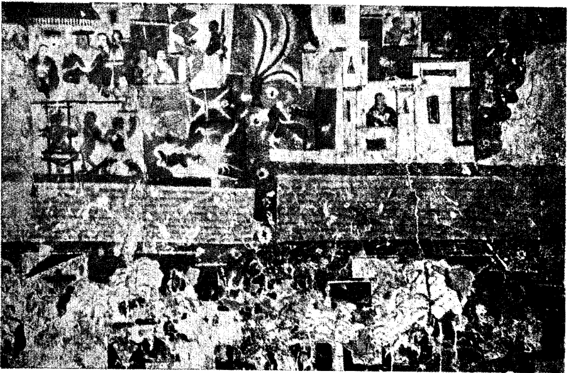
Plate XXII. Tabo, Chil-kang : Buddhist mandala