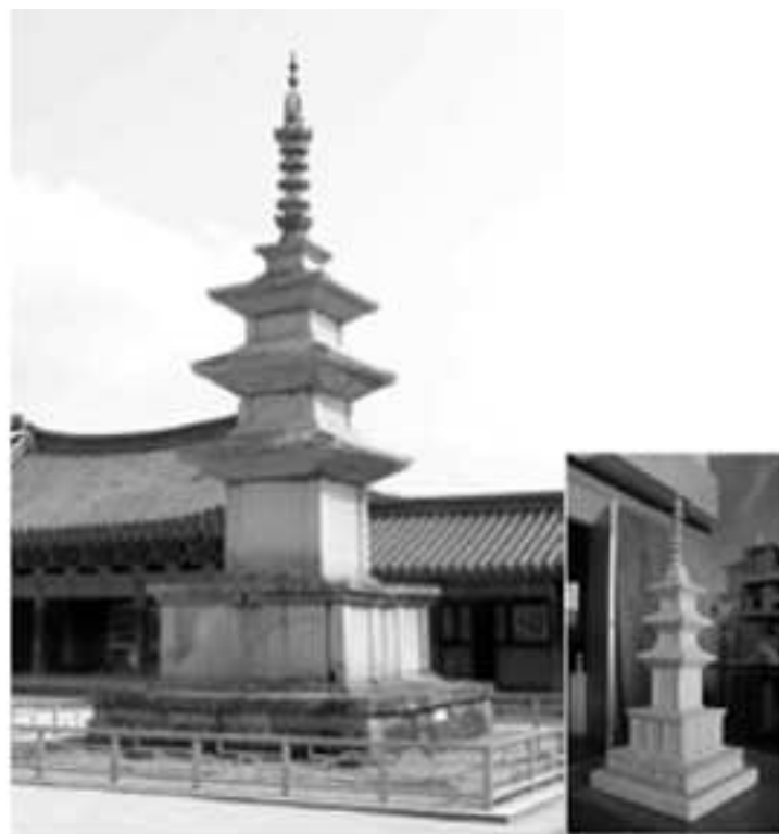
Figure-1 Click here to download high resolution image