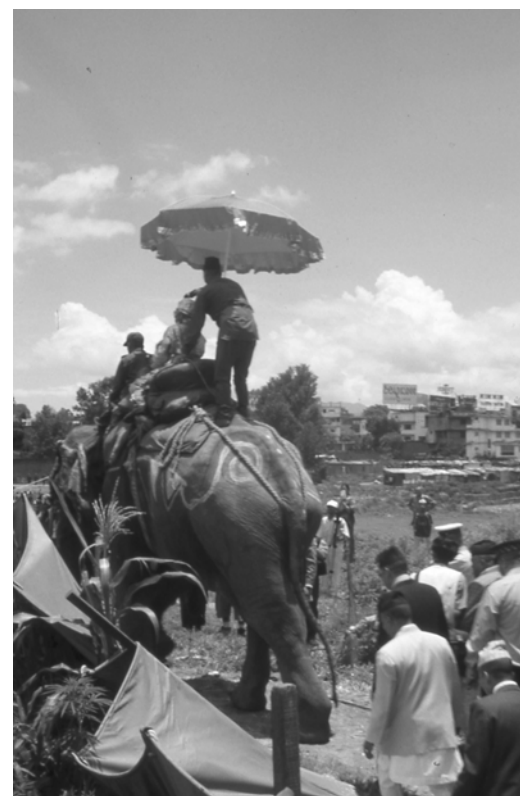
Departure on the elephant, heading for Jawalakhel.

Some of the priests and palace officials, all similarly dressed, were busy getting everything ready for the brahmin to be led in at any moment. One did not have to wait long for him to appear. Dressed in a white dhoti and wearing the janāi , 22 he was