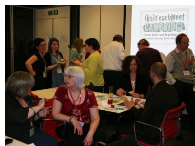
Networking at the second Cambridge LibTeachMeet.

Programme participants were actively encouraged to read each other's blogs and to comment on posts they read. This led to the development of a strong online community among