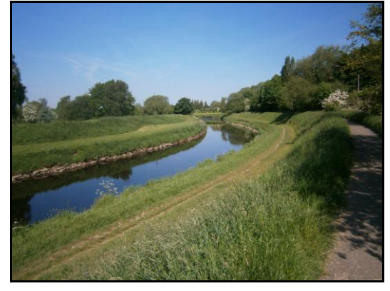
Figure 1. Section of the River Mersey Running through Didsbury

Within the basin, there are two residential properties and a number of local amenities such as recreational land, a rugby club and clubhouse, football club, a golf club and allotments. Under the Reservoirs Act 1975 , with additional clarity now provided by the Flood and Water Management Act 2010 , the flood basin was not deemed to be operating adequately (Environment Agency, 2010). The body in England responsible for the implementation, management and