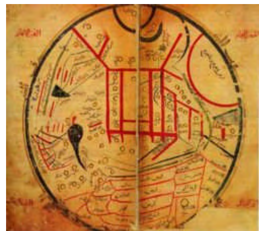
Map from Kashgari's Diwan , showing the distribution of Turkic tribes.

No Turk without a Tat (i.e. Persian); without a head no hat.