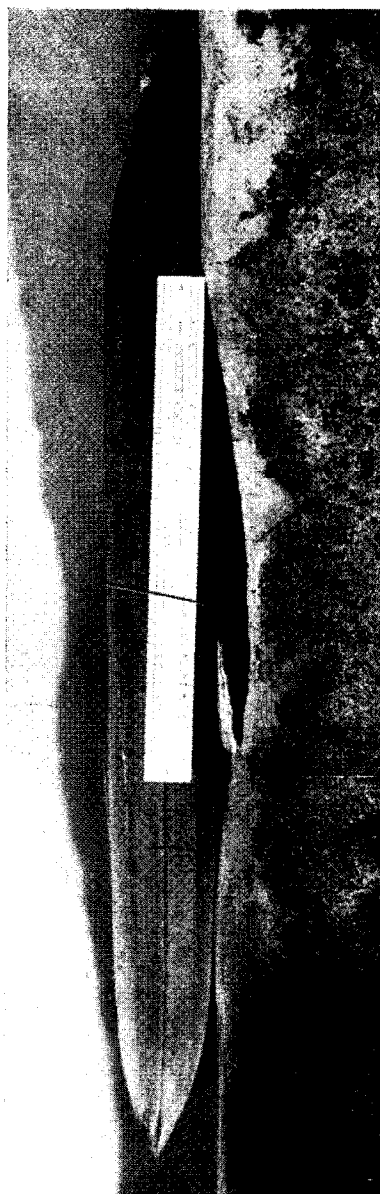
FIG. 3 MATURED POD CONTAINING SEEDS (Note size from 12" ruler)