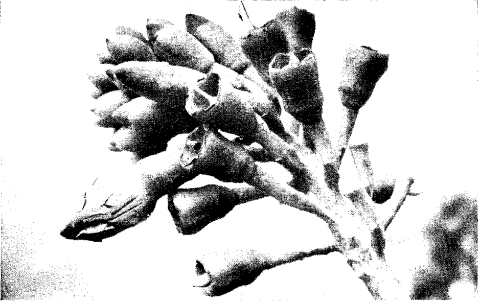
FIG. 1 ORONYLUM INDICUM: FLOWER BUDS