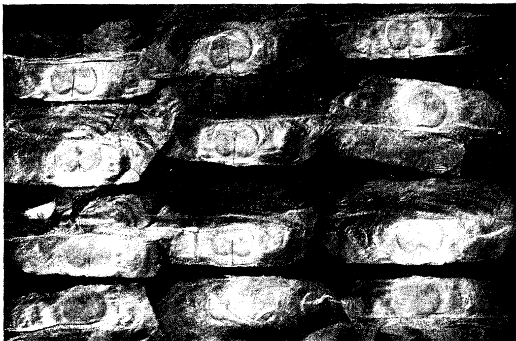
FIG. 4 CHIFFON-LIKE SEEDS (Natural size 2" to 2.5")