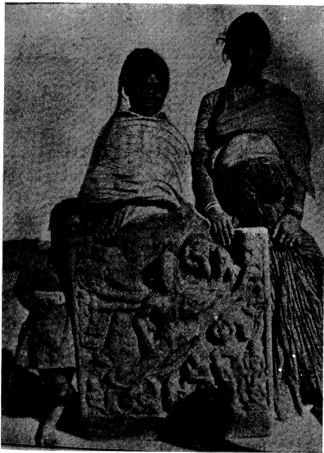
Viṣṇu taking the three steps. Image consecrated by the king Mānadeva in honor of his mother Rājyavatī. (Hamlet of Lajampat)