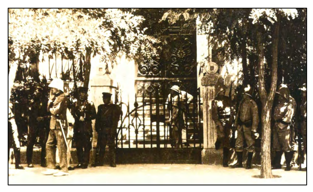
Figure 2. Closure of the Beijing branch of the Deutsch-Asiatische Bank in 1917.