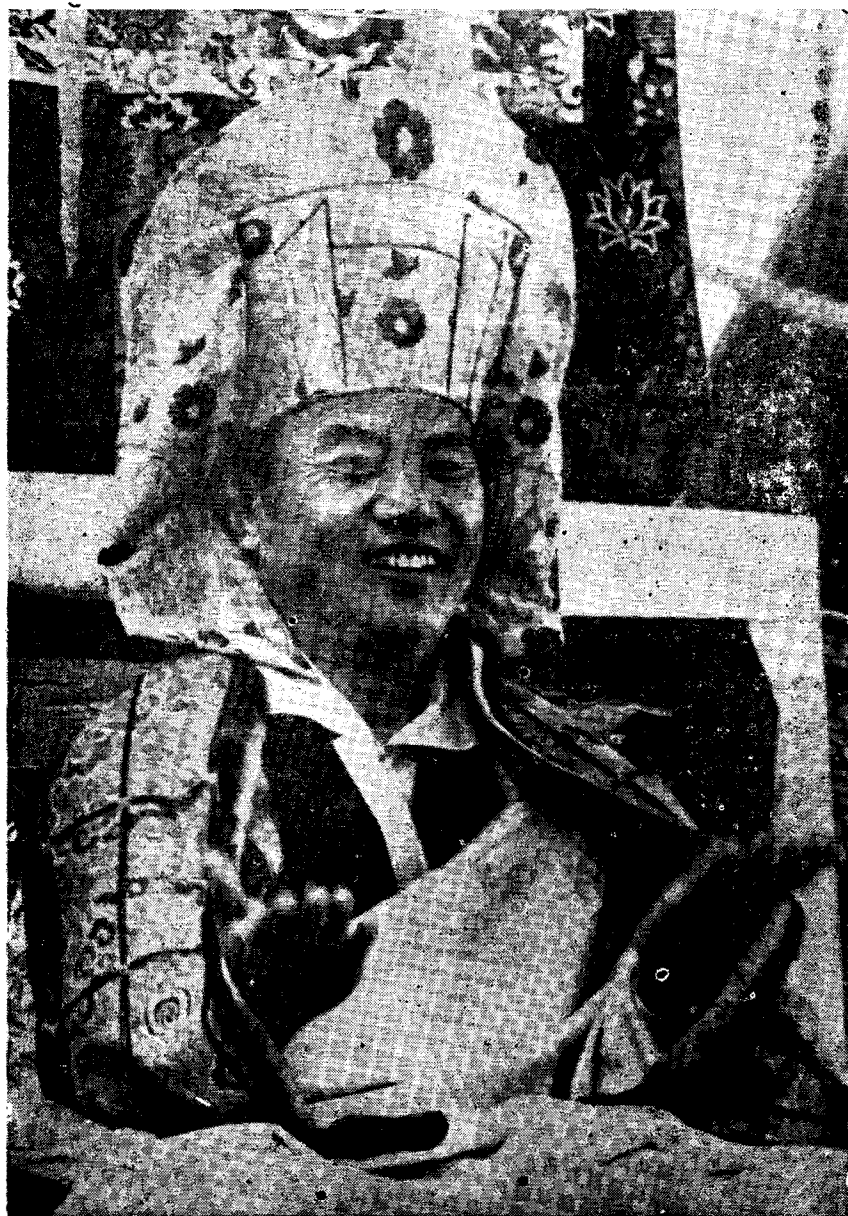
His Holiness the XVI Gyalwa Karmapa (1924 - 1981 A. D.)