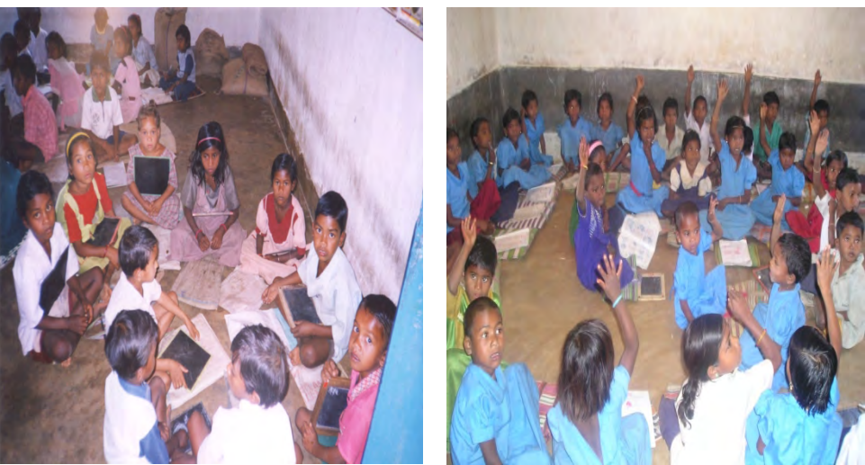
Children in classroom, Kalahandi district, Orissa

The problems are many, but the social issues can be resolved only through social consciousness and awareness.